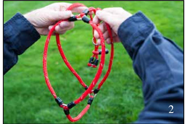
Hold the loops with the smaller loop closest to your body as shown in photo 2.