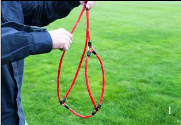
Prepare harness by making one large loop and one smaller loop as show in photo 1.