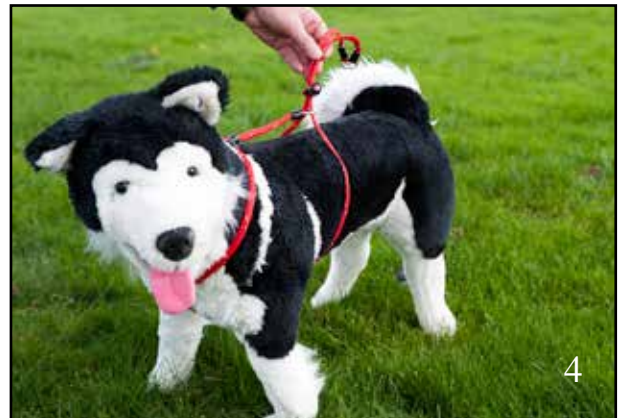
Lift the dogs front legs forward through the larger loop one at a time. Then position the larger loop around the dogs mid-section as shown in photo 4.