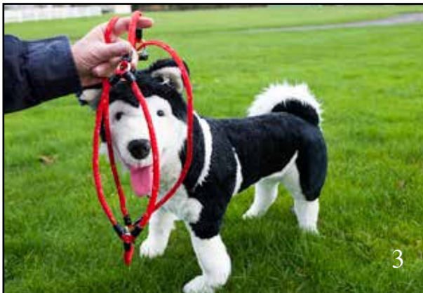
Slip both loops over the dogs head at the same time with the large loop going on first. See photo 3.